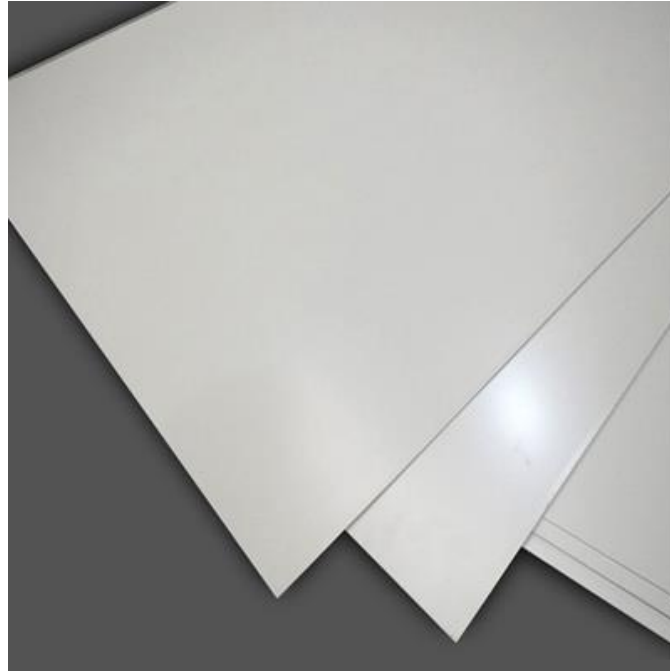
Lámina Pintro Lisa